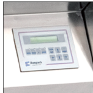
OPERATOR PANEL / PUPITRE DE COMMANDE

Due to continuous improvement, designs and specifications are subject to change without notice / Modification des données techniques possible sans préavis.