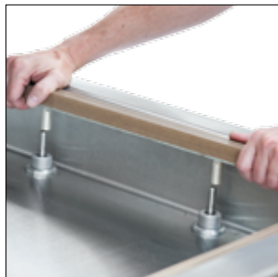
SEALING BAR REMOVAL / BARRE DE SOUDURE EN DÉMOTAGE RAPIDE

Optional on request / Option sur demande